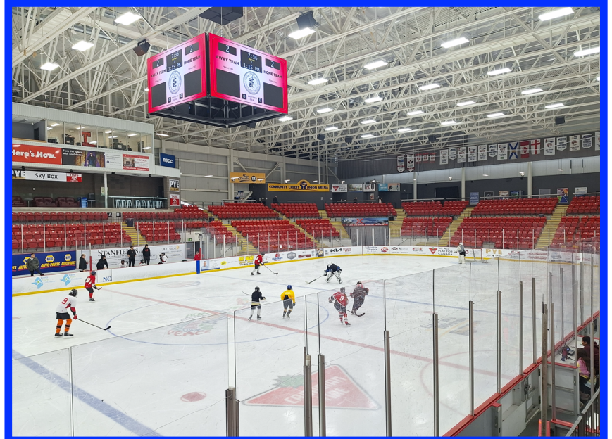
Rock Climbing and Teachers vs. Students Hockey Game