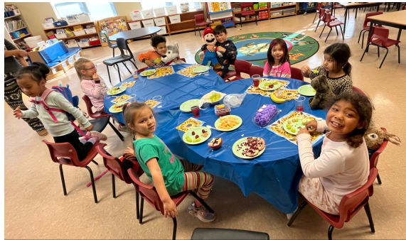
Teddy Bear Picnic